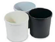
Waste paper basket Colour _____ EUR 6.00 each

Further items of furniture for hire and additional furnishings may be found in the Stand Construction Service Booklet.