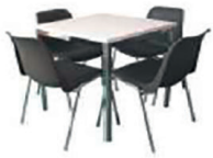
Set of connecting chairs EUR 93.00 each

Furniture hire *Please enter the desired quantity in the box