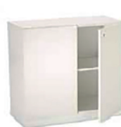
Basel sideboard 80x40x80 cm EUR 59.00 each