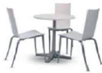
Olly Tango set EUR 156.00 each