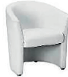
Romeo armchair 63x59x77 cm EUR 64.00 each