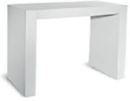
Bridge bar table 140x70x110 cm EUR 113.00 each