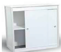
Leipzig counter, with closing door 100x50x100 cm EUR 98.00 each