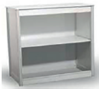
Leipzig counter, open 100x50x100 cm EUR 64.50 each