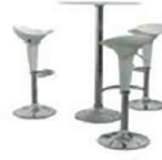
Snow set EUR 199.00 each