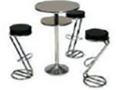
Z set EUR 126.00 each